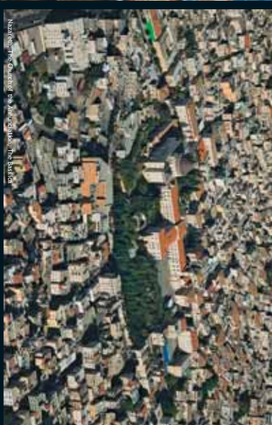
Nazareth, The Church of the Annunciation, The Basilica