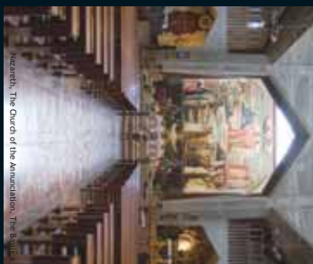
Nazareth, The Church of the Annunciation, The Basilica