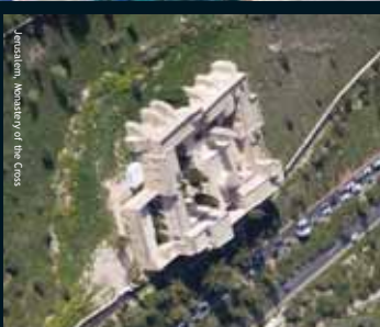
Arcade, Ministry of the Cross