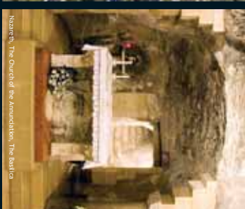
Nazareth, The Church of the Annunciation, The Basilica