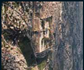
Jerusalem, The Old City