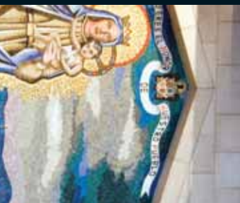
Nazareth, The Church of the Annunciation, The Basilica