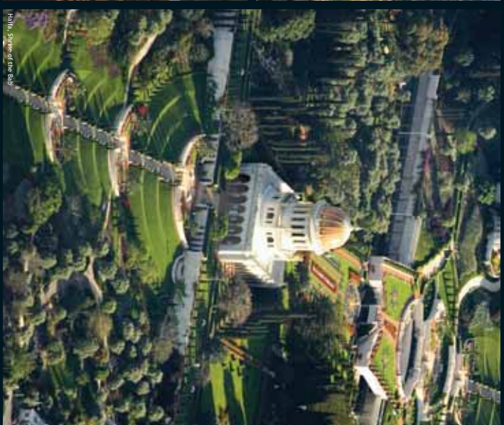
Hatifa, Site of the Sab